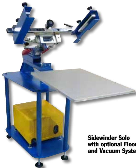
Sidewinder Solo with optional Floor Stand and Vacuum System

2 Solo Tabletop & Floor Stand depths are with 41 x 56 cm (16" x 22") pallet; Solo Oversize depth is with 112 x 97 cm (44" x 38") pallet.