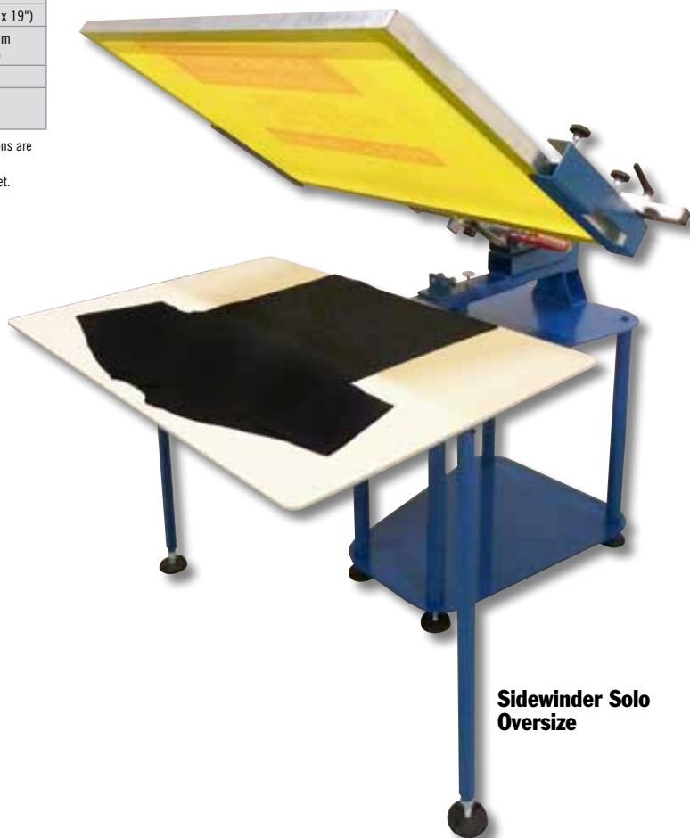
Sidewinder Solo Oversize